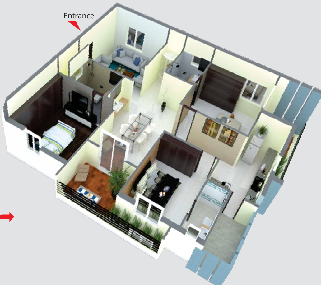
Block E: Flat No.11 & Block G: Flat No.6,8

3 BHK 1815 sft West Facing Drawing - 13'.9"x11'.12" Dinning - 11'x16' Balcony - 11'x6'.7" Kitchen - 9'.2"x12'.1" Master B.room - 13'.9"x11' Toilet - 9'x5' Children B.room - 14'.3"x11'.2" Toilet - 6'.8"x6'.9" Balcony - 6'.6"x9' Guest B.room - 11'.6"x11'.7" Toilet - 4'.5"x8' Utility - 8'.9"x8'.4" Pooja Room - 3'.11"x6'.9"