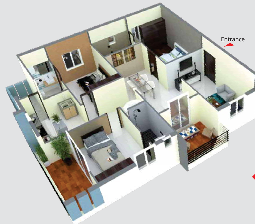
Block E: Flat No.10 & Block G: Flat No.5,7

3 BHK 1815 sft West Facing Drawing - 11'.10"x13'.5" Dinning - 10'.9"x17'.10" Balcony - 10'.10"x7' Kitchen - 11'.1"x9' Master B.room - 11'.10"x13'.5" Toilet - 10'.9"x4'.11" Children B.room - 13'.6"x11' Toilet - 4'.5"x7'.11" Balcony - 5'.2"x11' Guest B.room - 11'.1"x12' Toilet - 6'.3"x7'.1" Utility - 5'.2"x7'.1" Pooja Room - 4'.5"x2'.5"